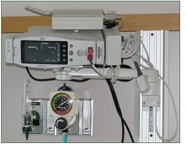
Figure 1. Rad-7 oximeter installed at bedside

DHMC uses a pulse oximetry-based floor monitoring system with direct nurse notification via pager specifically designed for the general floor environment. Standard bedside pulse oximeters communicate over the hospital's wireless infrastructure, connecting to a computer server and admitting station (Figure 1). Nurses receive direct notification via pager when an alarm condition is violated. The default definitions of these alarm conditions are configurable by biomedical engineering.